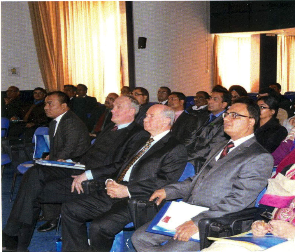
Participants of previous batch of ITP on BAFM at ICPE, Slovenia